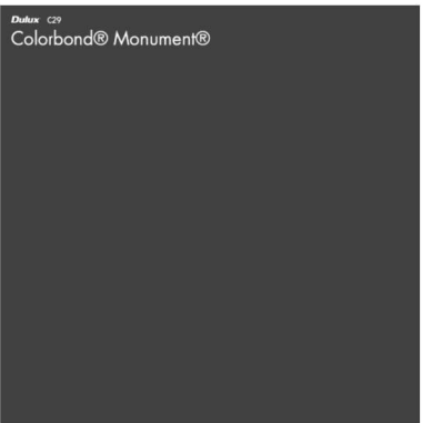
ROOF SHEETING DULUX COLORBOND - 'MONUMENT'