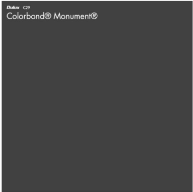
SELECT PROFILED ROOF TILES DULUX COLORBOND - 'MONUMENT' OR SIMILAR