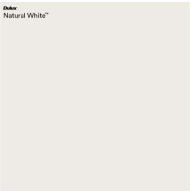
STUD WALL WITH FC CLADDING WITH SELECT RENDER PAINTED DULUX - 'NATURAL WHITE'