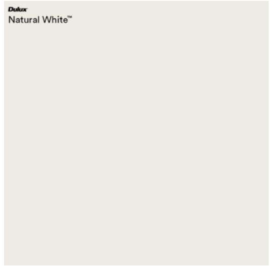
EXISTING BRICKWORK TO FINISHED WITH SELECT RENDER PAINTED DULUX - 'NATURAL WHITE'